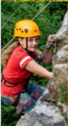
Youth and Education Groups