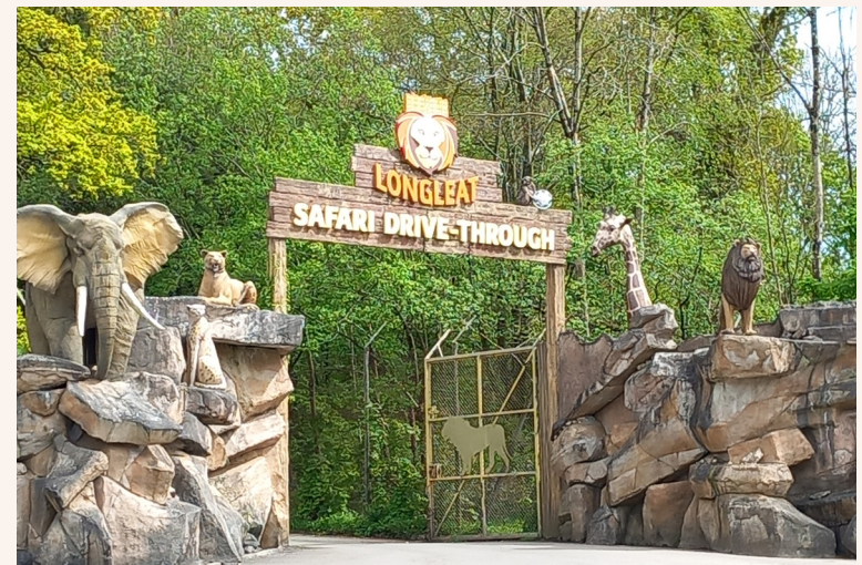
Safari entrance gates