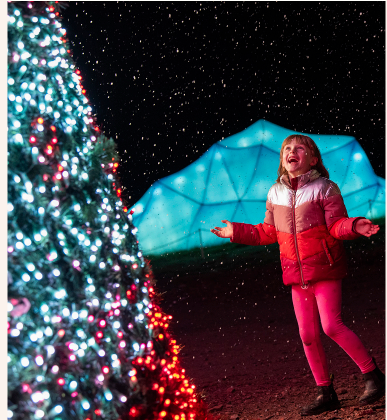
The Enchanted Christmas Tree Show