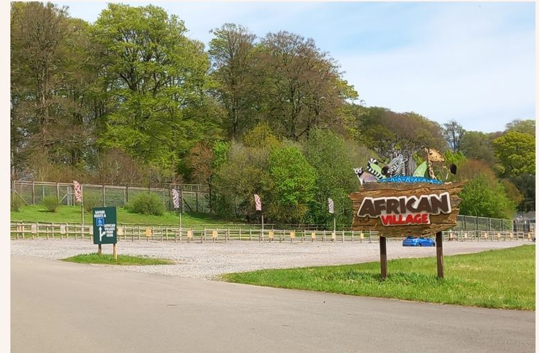
African Village car park

There are toilets in African Village too. There are no more toilets until you come out of the safari park.