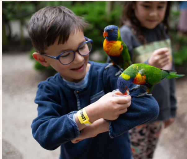
Lorikeets in the aviary