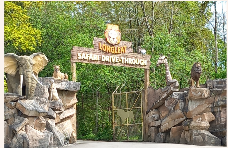
Safari entrance gates