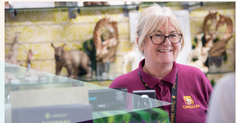
Attractions, shops and guest services team members – burgundy shirt