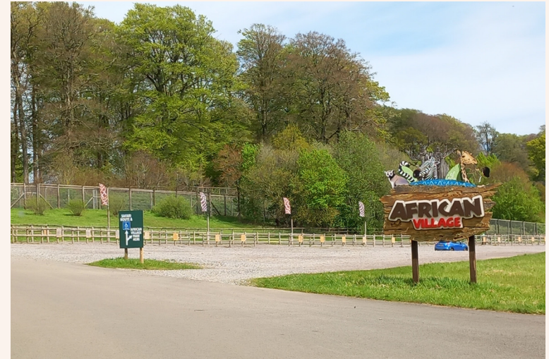
African Village car park

There are toilets in African Village too. There are no more toilets until you come out of the safari park.