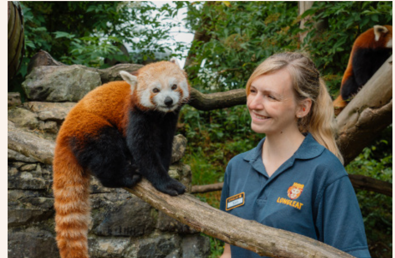
Animal team members – blue shirt