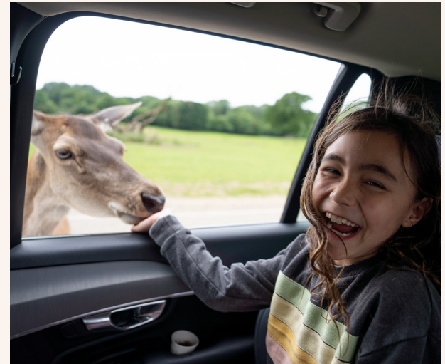
Deer in the safari park