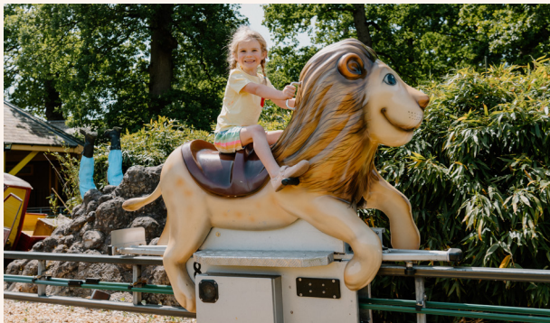
Rockin' Rhino ride