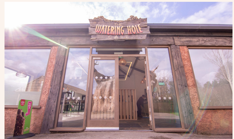
The Watering Hole is a place to get food and drink