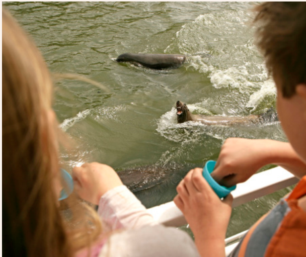
Sealions on the boat

There are places you might be able to feed some animals too. Some of these areas may be quite noisy.