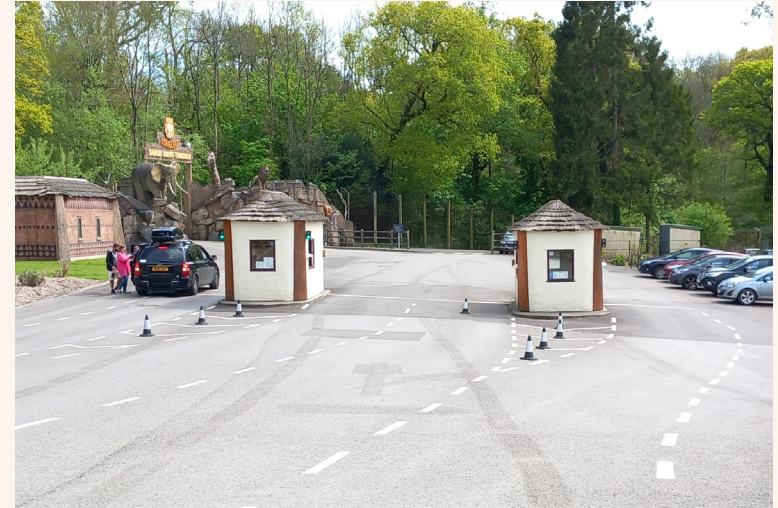
Safari toll booths

You may be going into the safari park during your visit.