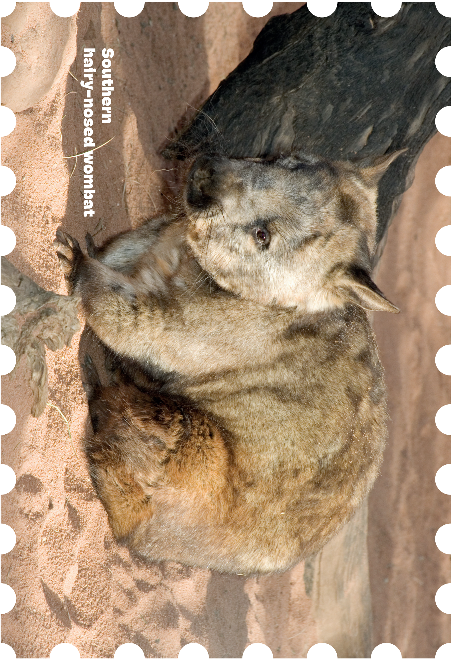
Southern hairy-nosed wombat