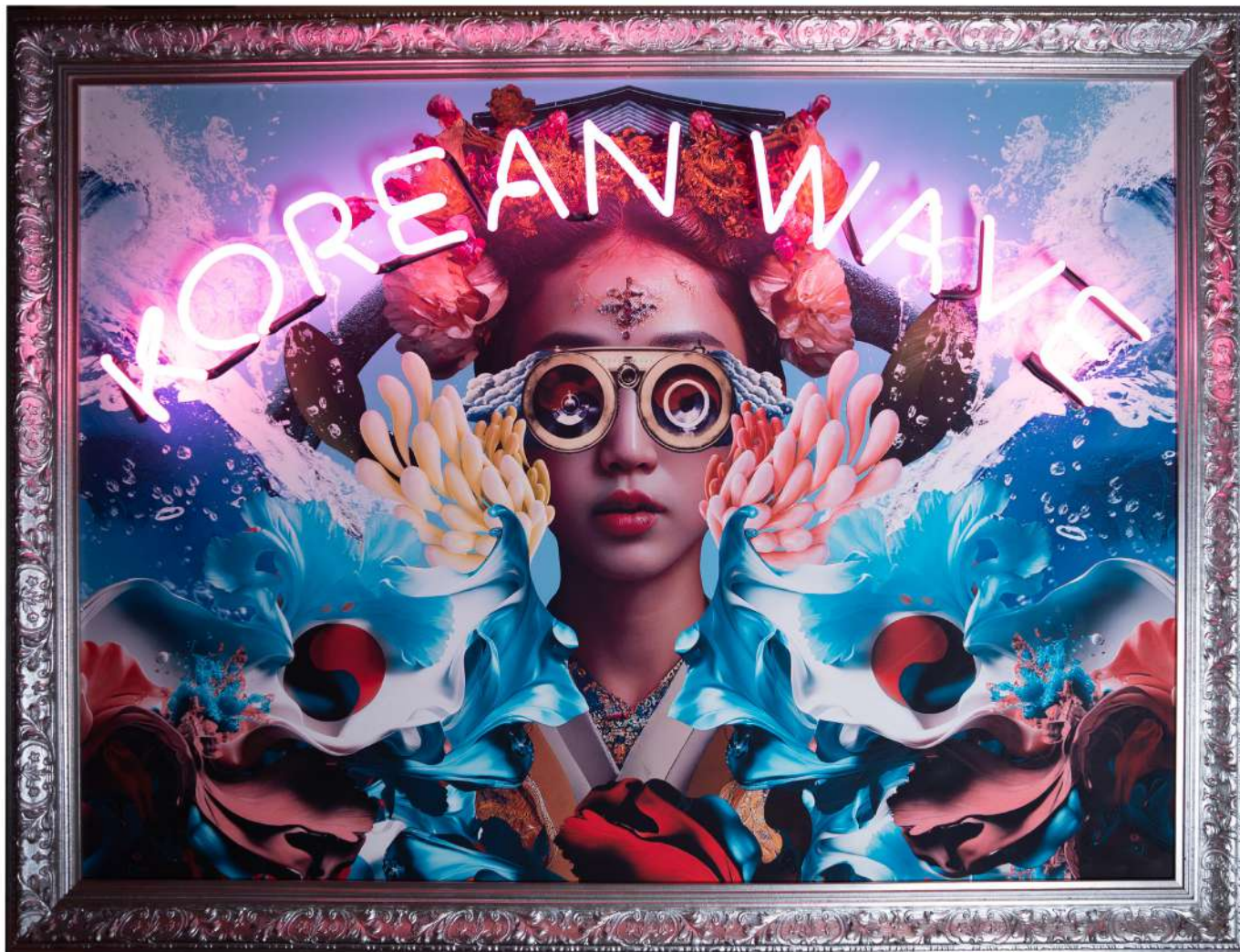
illuminati Neon x Regina Kim, K-WAVE , 2023, Neon on painted canvas, 97 x 131 cm