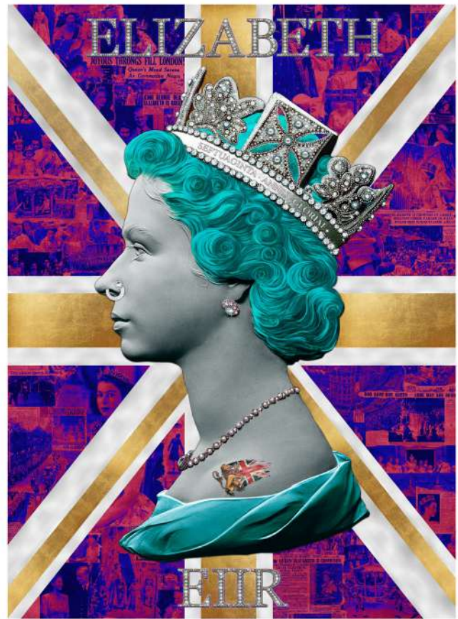
Illuminati Neon, New Tribute Queen , 2023, Print, 90 x 120 cm