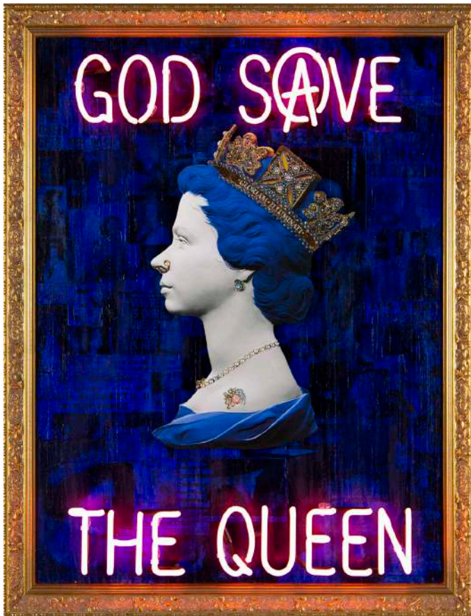
Illuminati Neon, Blue Queen , 2022, Neon on painted canvas, 105 x 128 cm