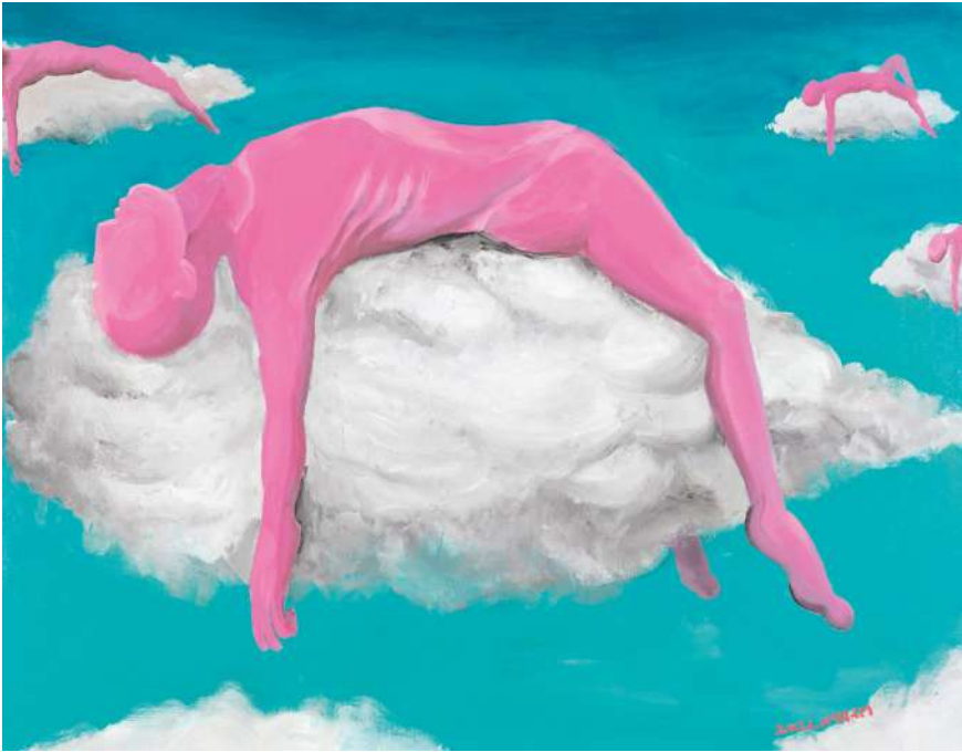
Ohnim, Cloud 1 , 2021, Acrylic on canvas, 117 x 96 cm, $21,000