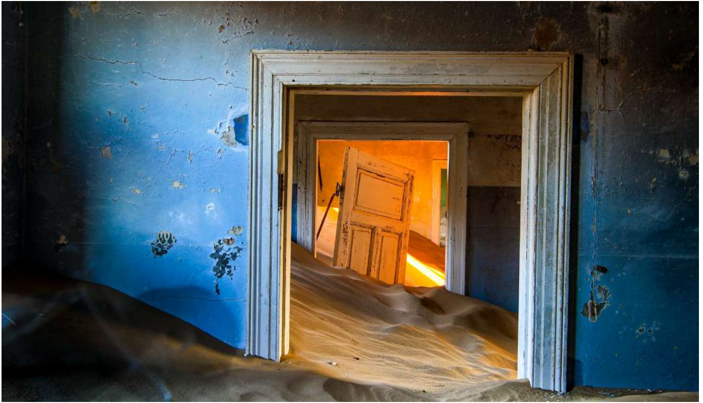
Marie Jordan, Off the Hook , 2013, Matt Diasec photograph, 150 x 100 cm, £1,500