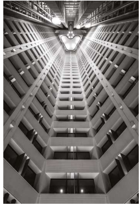
Yooyeon, Tokyo 1 , 2020, Photography, 75 x 150 cm

This October, Frieze Week will see StART explode with energy at Saatchi Gallery, with a massive site specific installation by felt sensation Lucy Sparrow and work by three of Korea's biggest K-pop artistes, alongside over 70 emerging and established global artists and galleries from more than 25 countries.