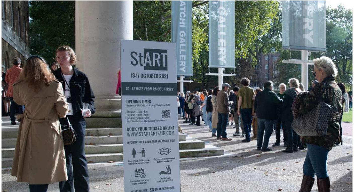
Outside Saatchi Gallery during StART art fair 2021