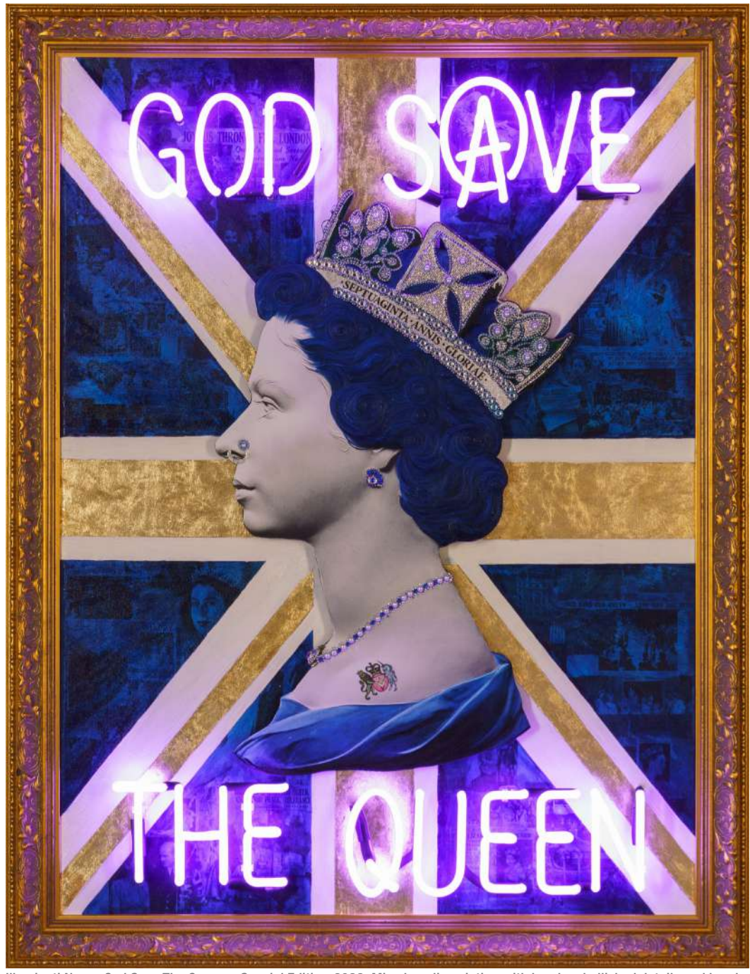
Illuminati Neon, God Save The Queen – Special Edition , 2022, Mixed media painting with hand embellished details and hand blown purple neon, 103 x 140 cm

Keep your finger on the pulse of the emerging global art scene and recapture the King's Road 70s vibe at StART Art Fair 2022 at Saatchi Gallery this October.