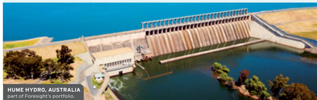
HUME HYDRO, AUSTRALIA part of Foresight's portfolio.