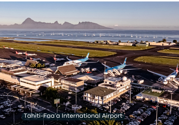
Tahiti-Faa'a International Airport

Combine new technologies with the creative talent of our teams to propose ambitious solutions that meet the needs of each project.