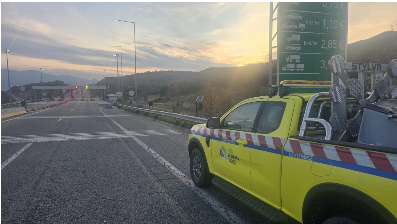
Operating vehicle in service