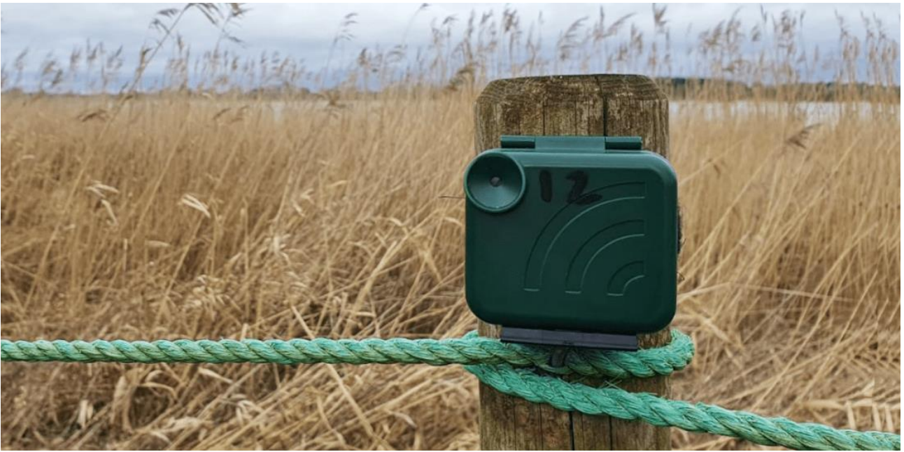
Figure 1. An example of a bioacoustic monitor.