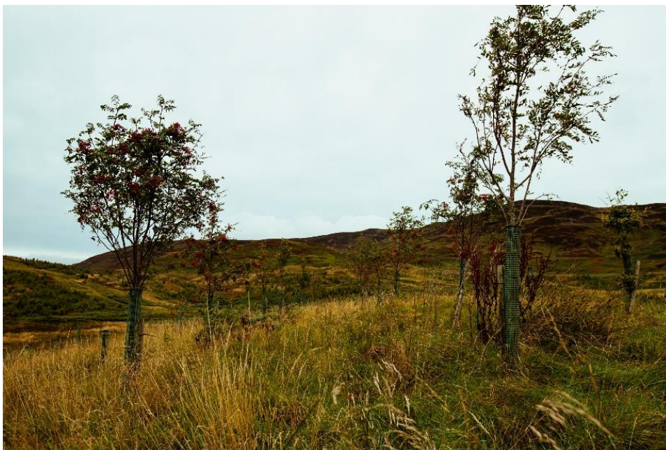
Figure 3. Fordie Estate, where the baselining is taking place.

baseline data collection for these metrics will be completed by summer 2024. In the coming months and years, a number of interventions will be made, including but not limited to a large afforestation scheme (with a focus on broadleaves and native species), re-wetting of peatlands and wetlands, improvement of hedgerows, regenerative grazing and wildflower meadow creation, with the target of improving the ecology, biodiversity, hydrology and financial sustainability of the estate. Data collection tested against the baseline will then track the impacts of the land use changes and land management practices applied by Foresight.