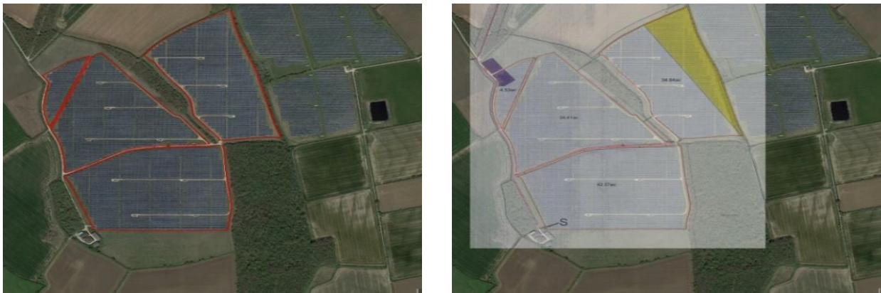
Figure 5. outlines the first two stages of Shapefile creation.

The first step is to create Shapefiles which digitally store the location, geometry and attribution of point, line and polygon features. The creation of Shapefiles requires an understanding of the site gained from technical diagrams, lease drawings and agreements, satellite imagery and in-person site visits and ground-truthing. Having understood where the site plan sits in the real world, boundaries can be drawn.