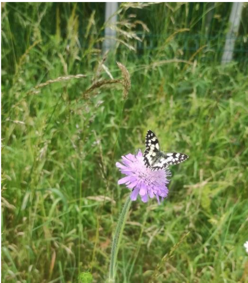
Figure 10. A marbled white butterfly on a field scabious.

The site appears to provide suitable habitat for skylarks and has previously supported both adults and young, however current use of the site is very limited. A change in grassland management is being considered to reduce the sward height which may encourage more skylarks to use the site.