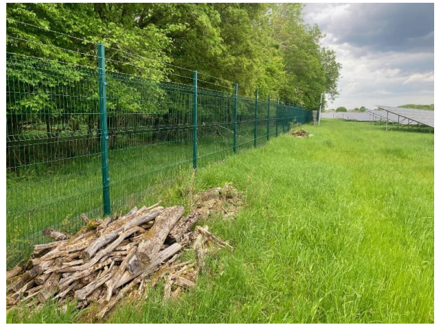
Figure 9. a Yellowhammer stands on a panel and habitat log piles are implemented around the site.