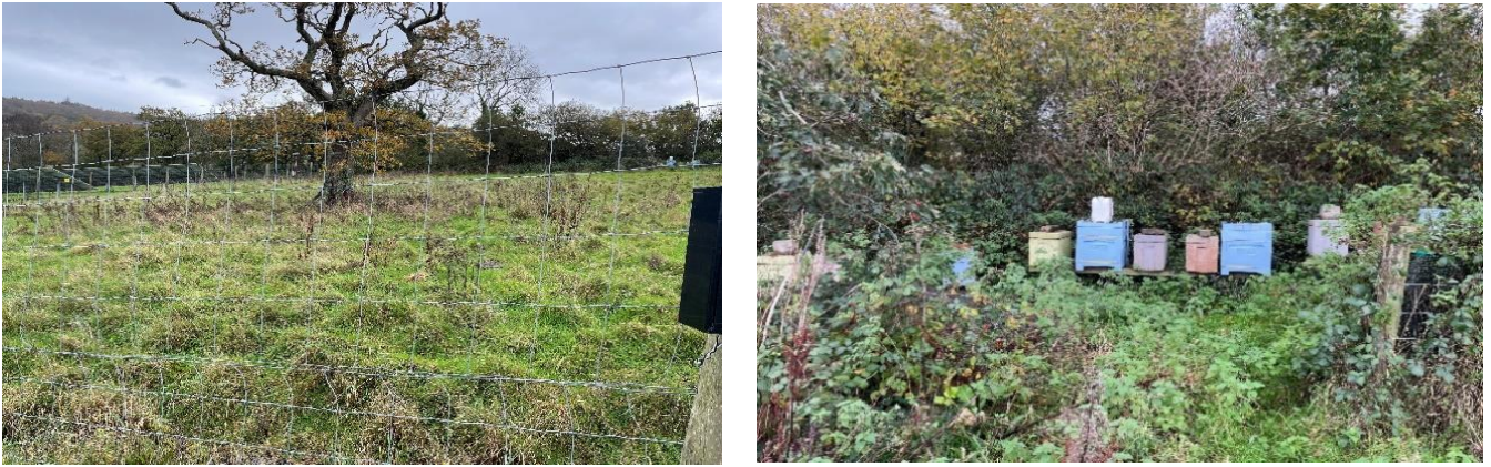
Figure 6. Images taken at the Sawmills site to evidence amendments.

The mapping is conducted in line with the UKHab habitat index , which is used to identify different habitats across Foresight's assets in the UK. As we expand the analysis, the European sites will reflect the EUNIS Habitat Annex I directive and Australian sites the AUS WIP.