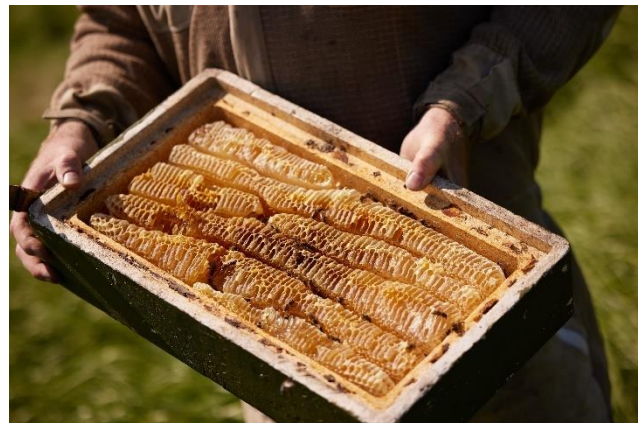
Figure 8. Images of FSFL’s Sandridge site bee hives (Continued).

Other biodiversity measures Foresight Solar expects to introduce at these sites, including the planting of wildflowers, will also benefit increased pollinator presence. So far, honey production at some of FSFL’s solar sites has improved as much as forty percent. Meanwhile, sale of the honey is concentrated in the areas near where it is harvested, generating additional localised economic benefit.