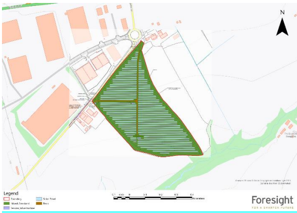
Figure 4. An example of land use mapping from one of our UK Solar sites.

Foresight’s infrastructure investment teams are developing detailed scale maps of each site in the relevant fund. Having oversight of proprietary land use data allows Foresight to track all current or potential future biodiversity projects to continue to help industry wide collaboration in the push for nature recovery.