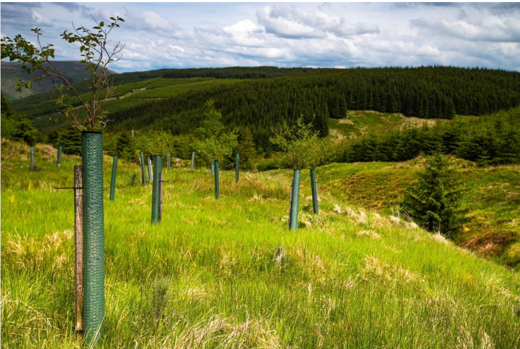
Figure 2. Afforestation at Shorthope.

Foresight’s approach to forestry and afforestation delivers a range of natural capital services to society, with timber production being the primary provisioning service from our forests. Other outputs from Foresight’s holistic land design and management approach include regulatory and maintenance services (e.g., carbon sequestration, biodiversity protection and flooding defence for the built environment), alongside cultural services (e.g., recreation and education).