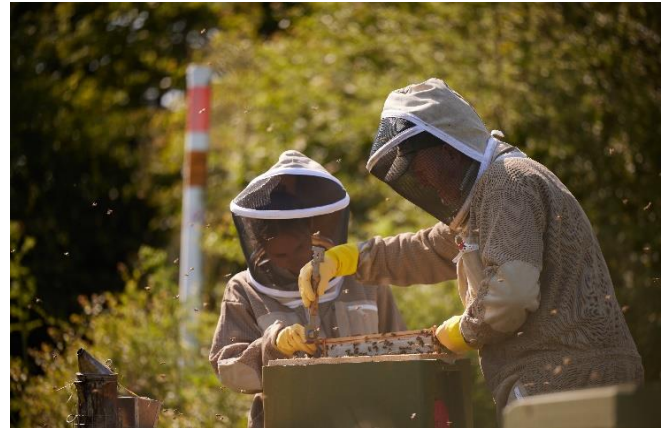
Figure 7. Images of FSFL’s Sandridge site bee hives.

Alongside other projects, Sandridge is increasing its pollinator presence through a bee farming initiative. Bees are vital to agricultural production and play an active role helping plants grow and to produce food. Partnering with a local bee farmer, Foresight deployed 80 hives across eight strategically selected locations on the large site. Careful consideration was given to select these sites, addressing the proximity of neighbouring hives and nectar availability to give the hives the greatest chances of success.