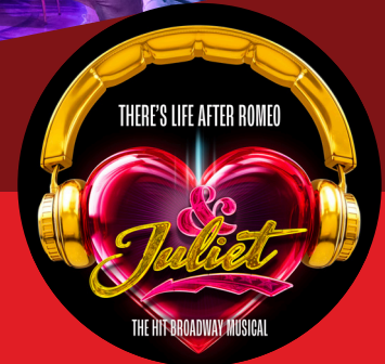
PHOTO CREDIT: The company of the North American Tour of & JULIET.

Created by the Emmy®-winning writer from "Schitt's Creek," this hilarious new musical flips the script on the greatest love story ever told. & JULIET asks: what would happen next if Juliet didn't end it all over Romeo? Get whisked away on a fabulous journey as she ditches her famous ending for a fresh beginning and a second chance at life and love—her way. Juliet's new story bursts to life through a playlist of pop anthems as iconic as her name, including "Since U Been Gone," "Roar," "Baby One More Time," "Larger Than Life," "That's The Way It Is," and "Can't Stop the Feeling!"—all from the genius songwriter/producer behind more #1 hits than any other artist this century. Break free of the balcony scene and get into this romantic comedy that proves there's life after Romeo. The only thing tragic would be missing it.