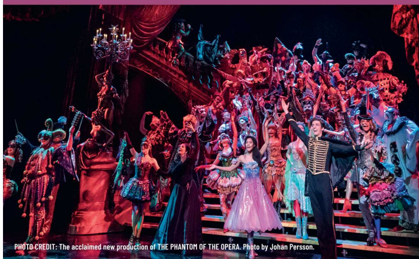
PHOTO CREDIT: The acclaimed new production of THE PHANTOM OF THE OPERA. Photo by Johan Persson.

Produced by CAMERON MACKINTOSH with THE REALLY USEFUL GROUP