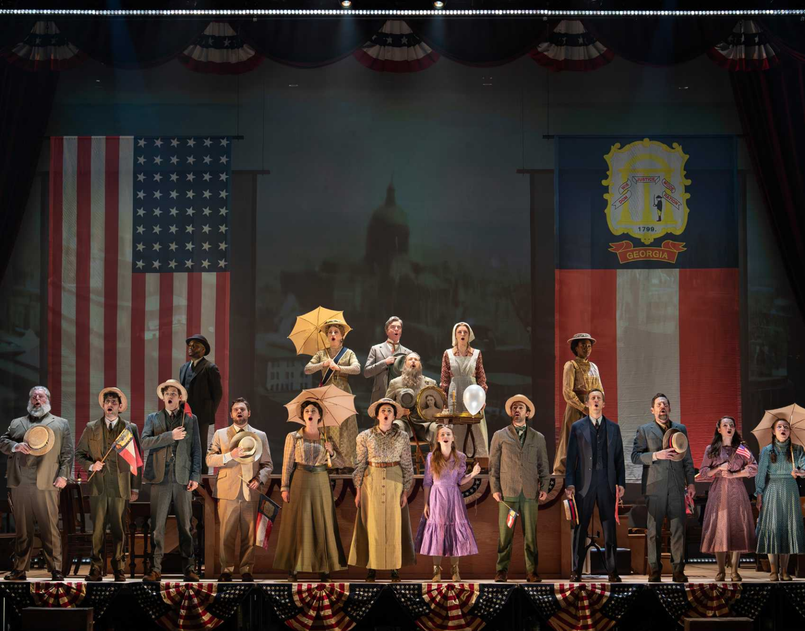
The National Touring Company of PARADE