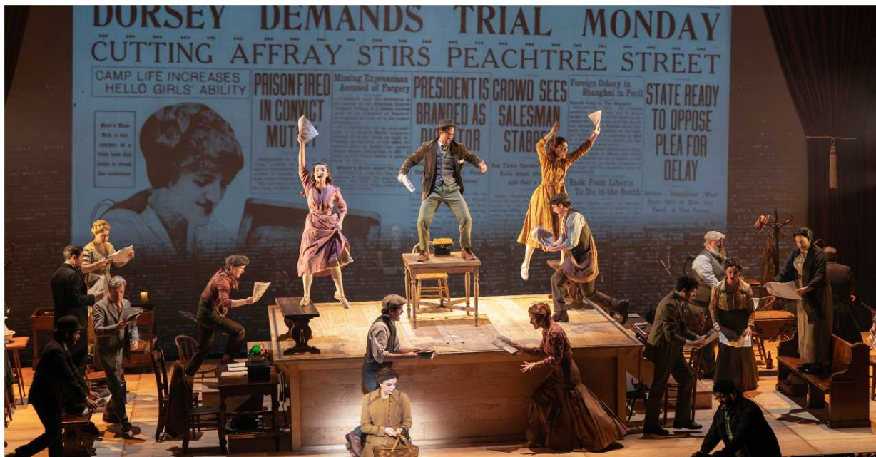
The National Touring Company of PARADE