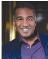
Norm Lewis Tony Award® Nominee The Gershwins' Porgy and Bess