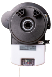
Opener with LED Courtesy Lights