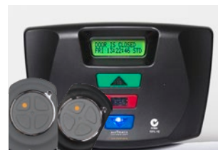
Logic Controls with two transmitters