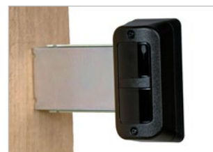
Wired PE Beams