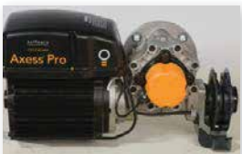
Opener with various install options