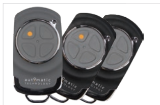
Three TrioCode™128 Remote Controls

When maximum spring balanced weight is 20kg.