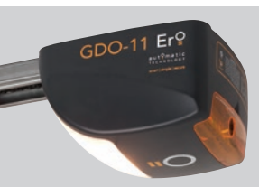
Opener with Courtesy Light